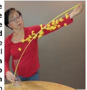
This forsythia branch is too long at 35 in. I will cut it to 28 in.