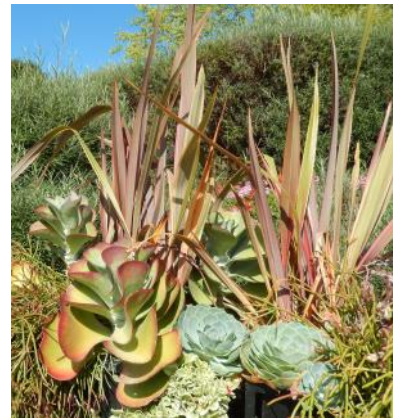
A very large container with a 'hot' combo of succulents