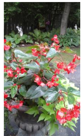
Joyce's dragonwing mix