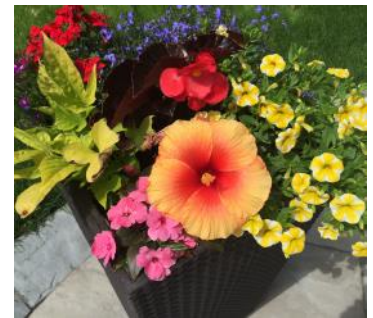
Barb's hot colour combo

Joyce Marsh - dragonwing begonias with lime green potato vine. Also, she loves a perennial combo including sedum, creeping jenny, lamium and ivy.