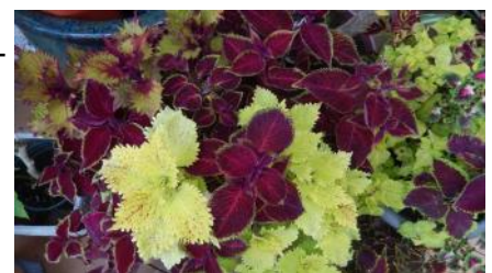
Sherry's lime and red coleus mix