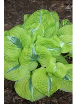
Hosta Time Traveller

Petunia "Pink Sky" - similar to Night Sky aka Starry Night but hot pink with white polka dots!