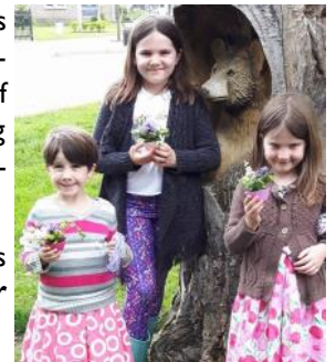
'Our Cupcake floral designs.'

As this is our major fund raiser we need your generous donations of large quality plants to succeed. Please remember to label your plants with name, size, colour and growing conditions.