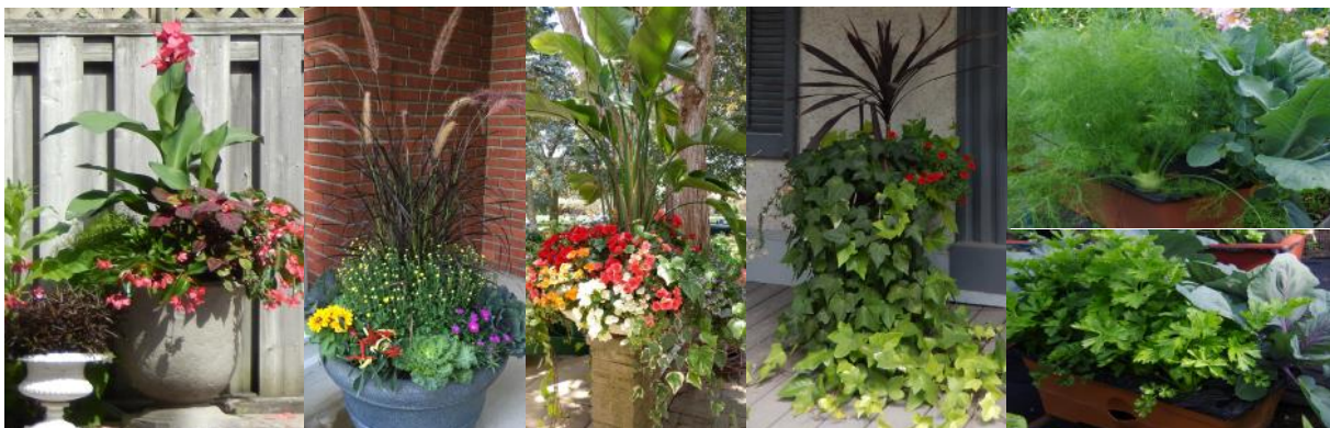
Containers from our members and homes on the WIB tour.