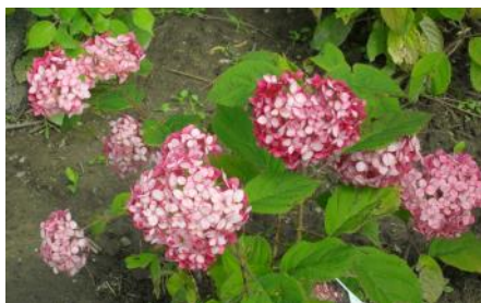
Hydrangea arborescens Ruby

Shrub Viburnum nudum "Brandywine" - not new, but a WOW shrub. Shiny, narrow leaves. First stage are the white flowers in spring, followed by white berries changing to apricot, then a combo of apricot & navy blue, finally all navy! Will thrive in wet locations. Brilliant fall foliage.