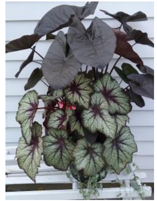
Lynda's dramatic combo

Lynda Chapman - my favourite is black taro, rex begonia, dichondra. This black and silver part shade combination looks great in a black pot or urn.