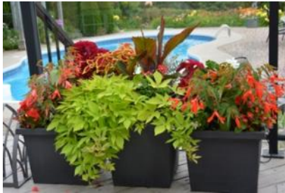
Jone's vibrant deck combos

Brian Gower - most consistent and favoured containers are the herbs I plant on the steps from the kitchen patio door; typically couple herbs in 4 large containers: couple of types of basil (to go with the fresh tomatoes from the garden), thyme, rosemary, cilantro, and parsley.