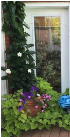
Barb's climbing mandevilla combo

Jone Webster - My deck containers include canna lilies or dahlias as centrepieces surrounded by geraniums, verbena, million bells trailing petunias, light-coloured potato vine, fibrous and dragon wing begonias, dusty millers, spider plants and colourful coleus. The coleus are a wonderful pop of colour all summer long and thrive even in sunny hot locations.