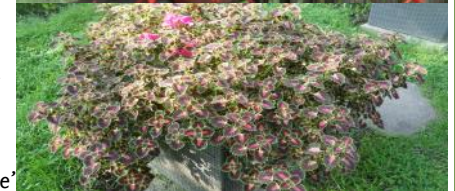
Right, top to bot., Begonia Boliviensis, Coleus 'Lava Rose'