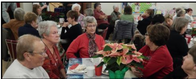
More BHS members enjoying the November AGM & Social

Save the Date: July 16, 2016 Whitby in Bloom Garden Tour