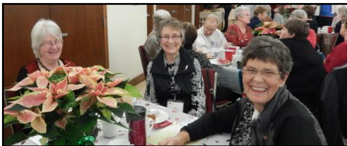
BHS members enjoying the November AGM & Social