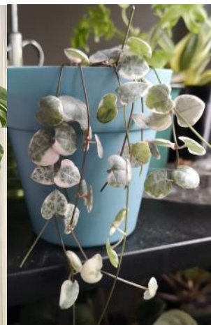
Left to Right: Philodendron 'Brasil' , Monstera Deliciosa , Ceropegia woodii variegata or String of Hearts