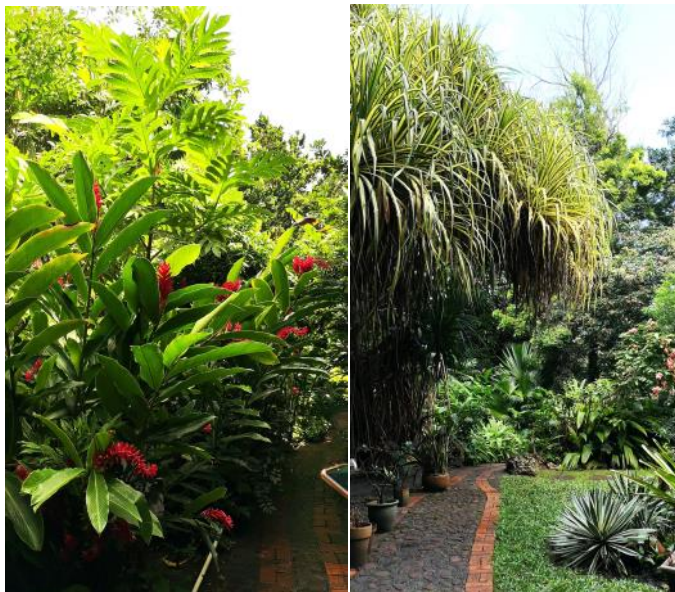
Andromeda Botanic Garden: left to right, flowering gingers under lobed leaves of a breadfruit tree; Pandan tree or screwpine with arching fragrant leaves that are used in flavouring South Asian dishes.

As I write this, I am dreamily thinking of the gentle surf rolling onto my toes while I'm admiring the lush greenery surrounding the sandy beach. I was lucky enough to live that dream back in November when we were invited by friends to join them on a visit to see their friends in Barbados. Despite temperatures hovering near 30 deg C, daily showers help create brilliant tropical blooms and lush vegetation of every shade of green. While there, I checked out a couple of gardens, Andromeda Botanic Gardens and Hunte's Gardens.