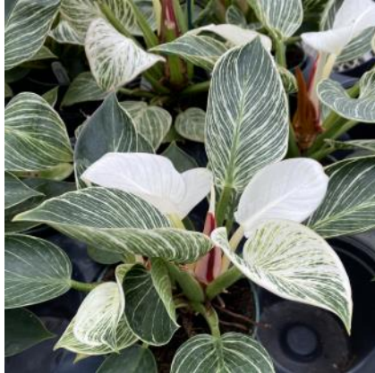
Above: Ficus Shivereana Moonshine , a variegated rubber plant cultivar, Below: Philodendron 'Birken'

If you are anything like me, my 'indoor garden' brings great joy during the cold winter months. A few 'feel good' habits have been established over the years and you may be guilty of some of these too! For example, how many of you are working hard to keep some of your 'over wintered' plants alive as 'house plants' until they can go back outside in the spring? How many of you are occasionally making 'impulse plant purchases' at the grocery store or local nurseries because you are missing your garden so much! I bet many of you are also taking cuttings and root propagating some of your favourite plants to increase your plant collections! There just aren't enough true gardening activities for our liking during the winter months and I often find myself wandering around the house tending to the forty plus house plants that are helping to keep me sane while my gardens are covered in snow.