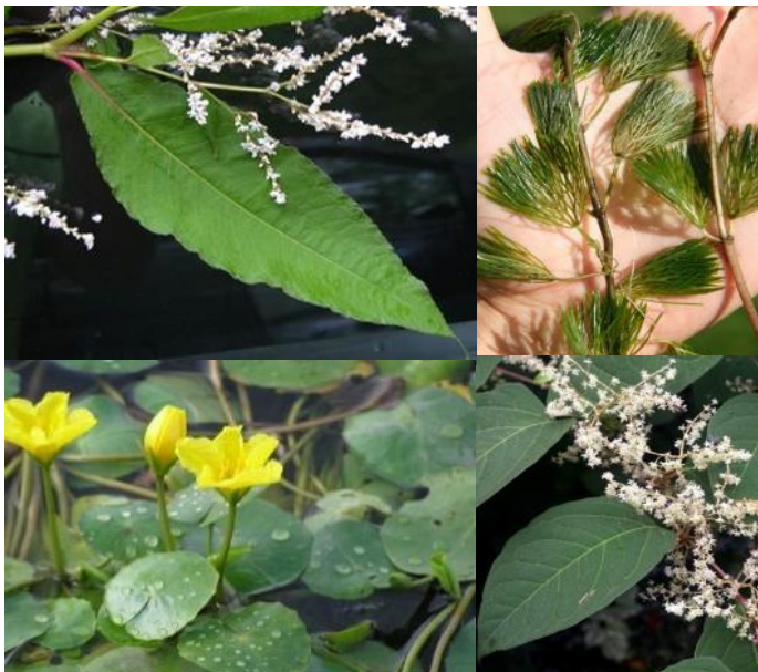
Clockwise, from top left: Himalayan knotweed ( Polygonum polystachyum ), Carolina Fanwort ( Cabomba caroliniana ), Giant knotweed ( Reynoutria sachalinensis ), Yellow Floating Heart