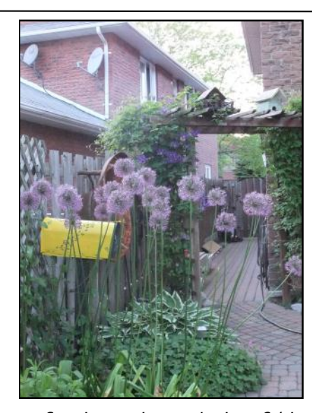
See this garden on the June 24th Garden Tour!

For more information, contact Sherry Howard at 905-668-7640 or <a href="https://howard21@rogers.com">howard21@rogers.com</a>